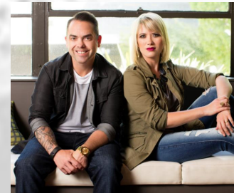
Brooke & Jubal 6am to 10am

Brooke and Jubal in the Morning, Ryan Seacrest Afternoon and Today's Hit Music Marathons All Day