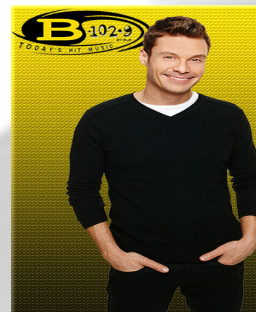
Ryan Seacrest 3pm to 7pm